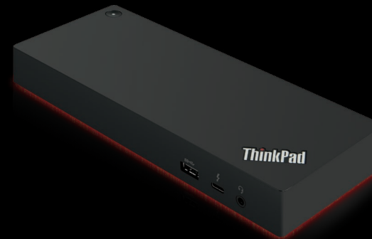
◀ ThinkPad® Thunderbolt™ Workstation Dock