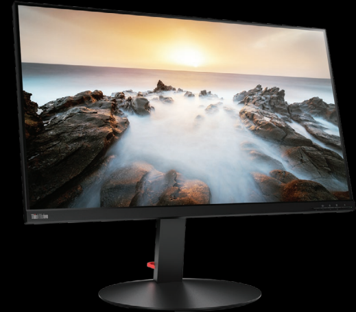
ThinkVision® P32u ▶ Monitor